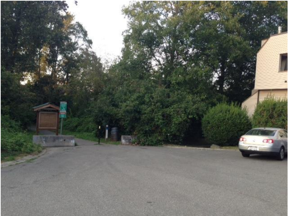
Photograph 3 Trail to Nicomekl River Floodplain, note residences in fire catchment area.