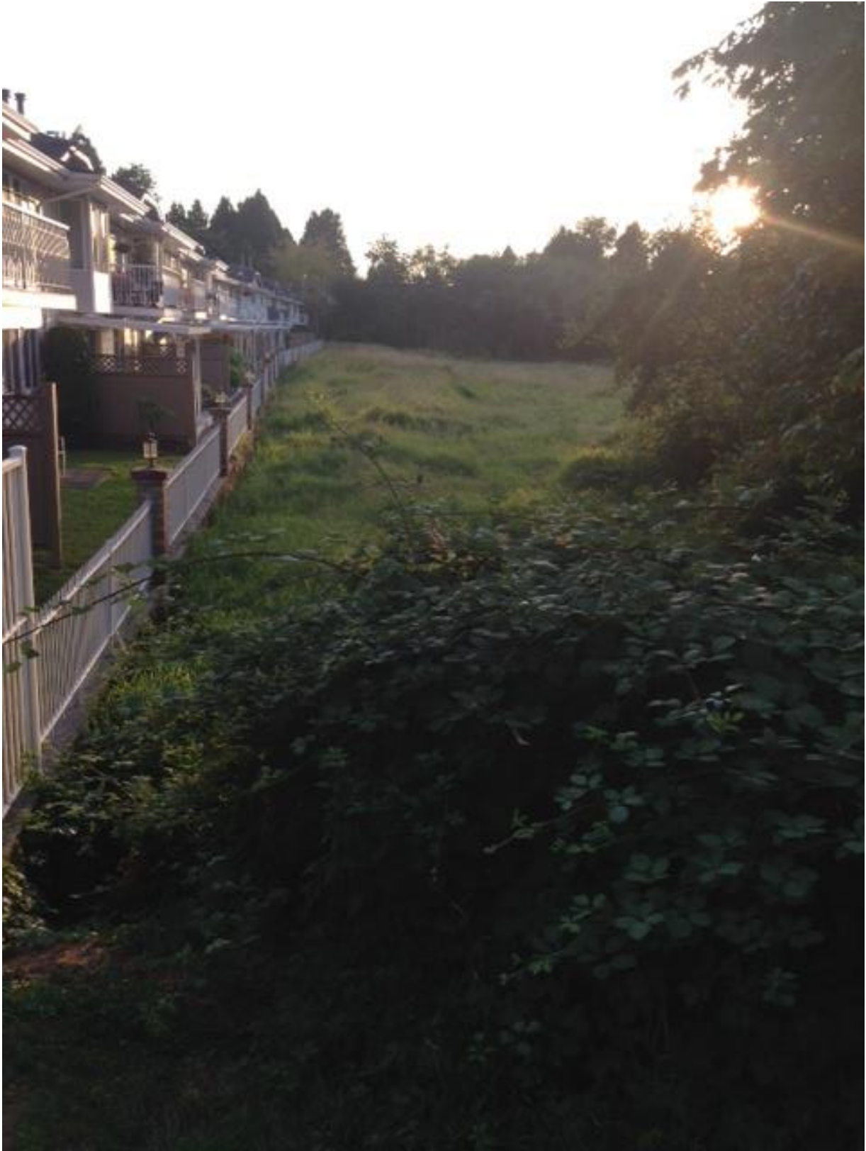
Photograph 2 Grassland, Nicomekl River Floodplain, note townhouses adjoining the grassland