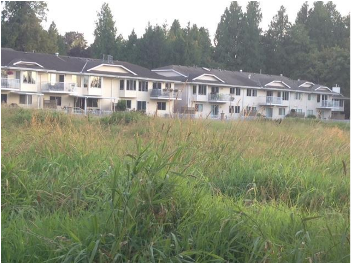
Photograph 1 Grassland, Nicomekl River Floodplain