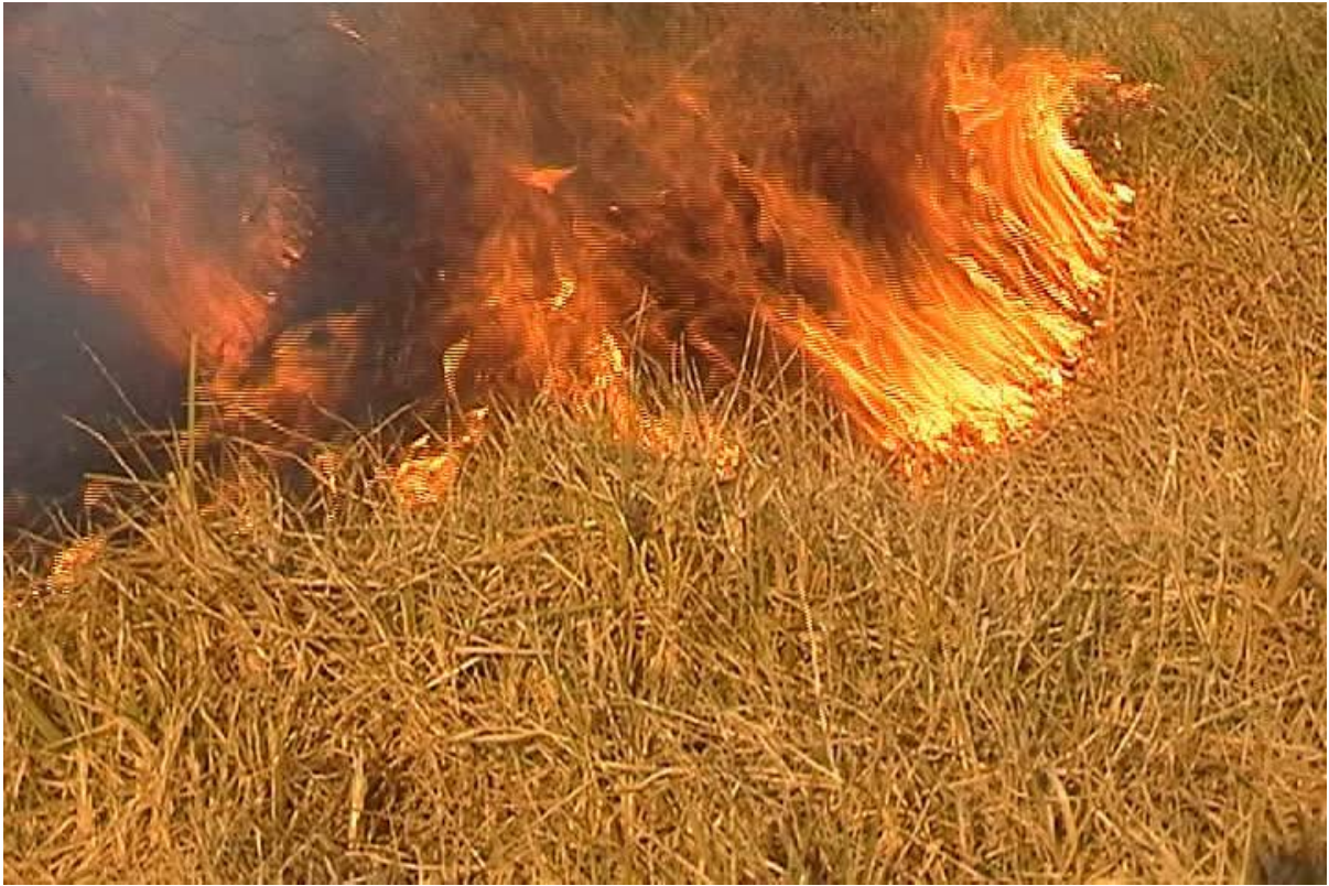
Photograph 4 A potential grassland fire.