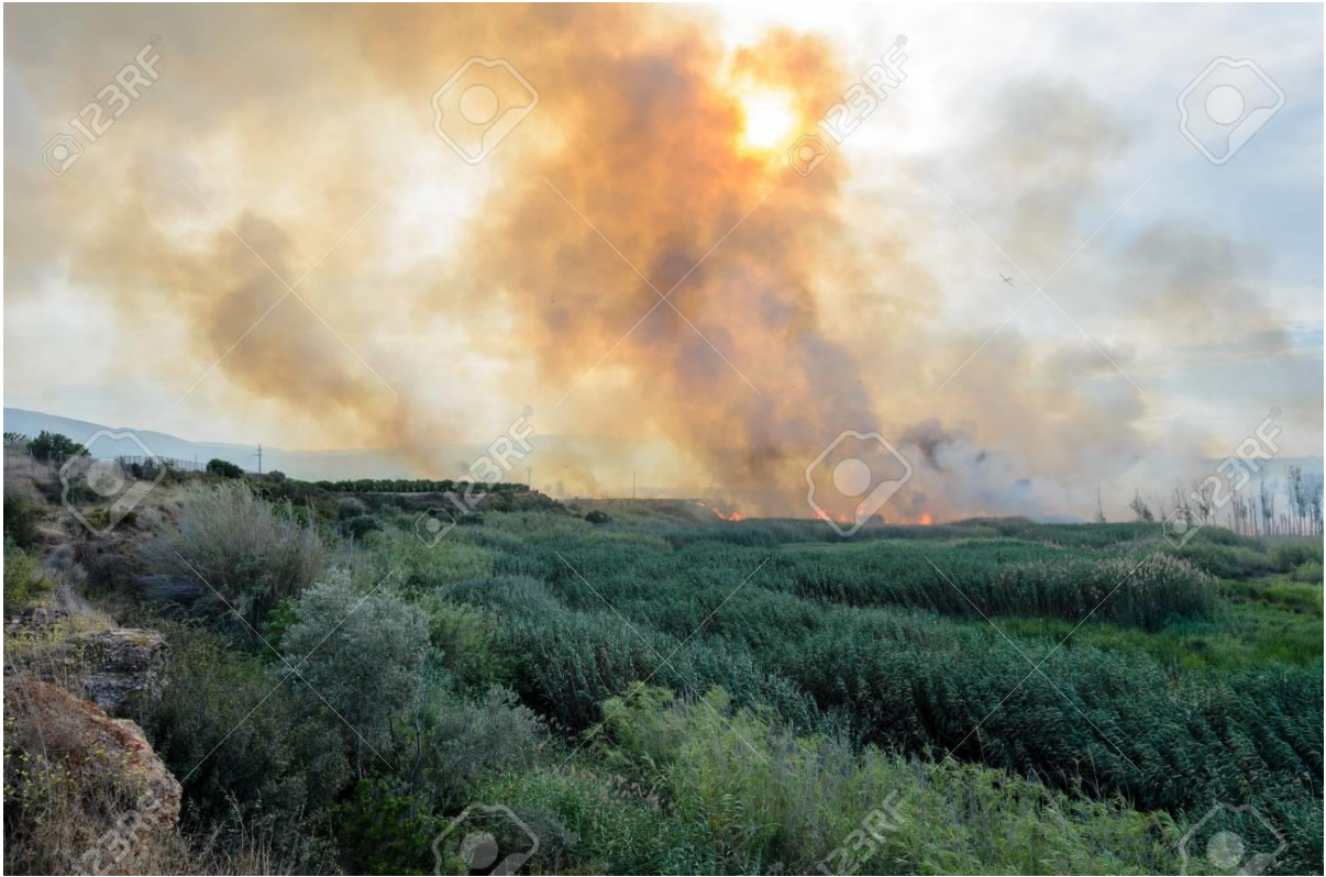
Photograph 5 Potential smoke and fire in a grassland.