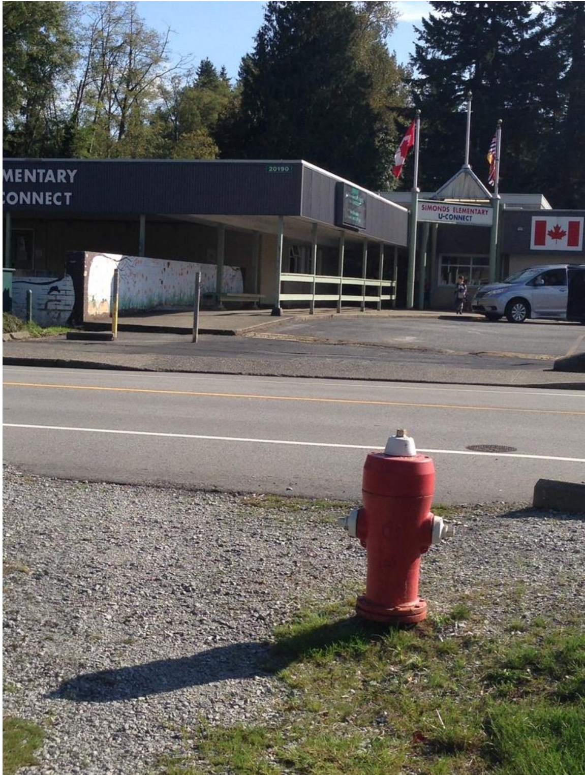
Photograph 4: Need a painted Crosswalk from the walkway to Simonds Elementary School