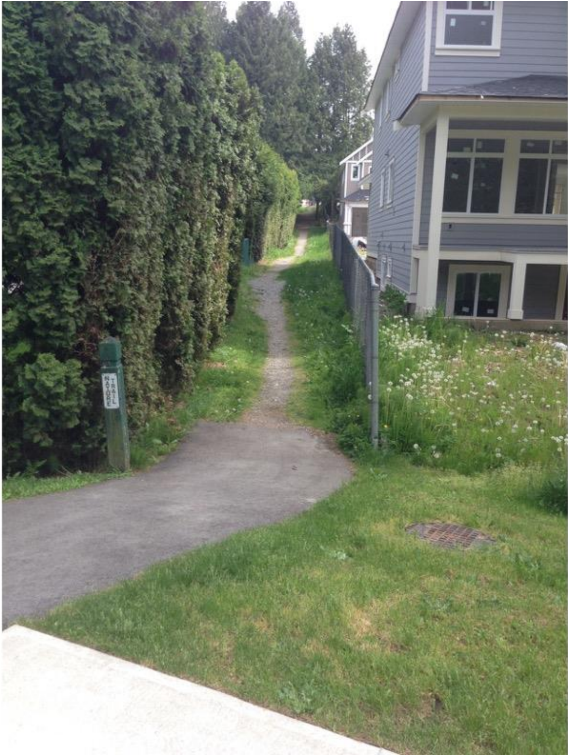
Photograph 1: Walkway from Grade Crescent to Simonds Elementary School