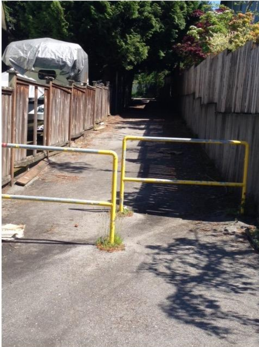
Photograph 3: Paved access walkway with access barriers, 202 Street to 203 Street.