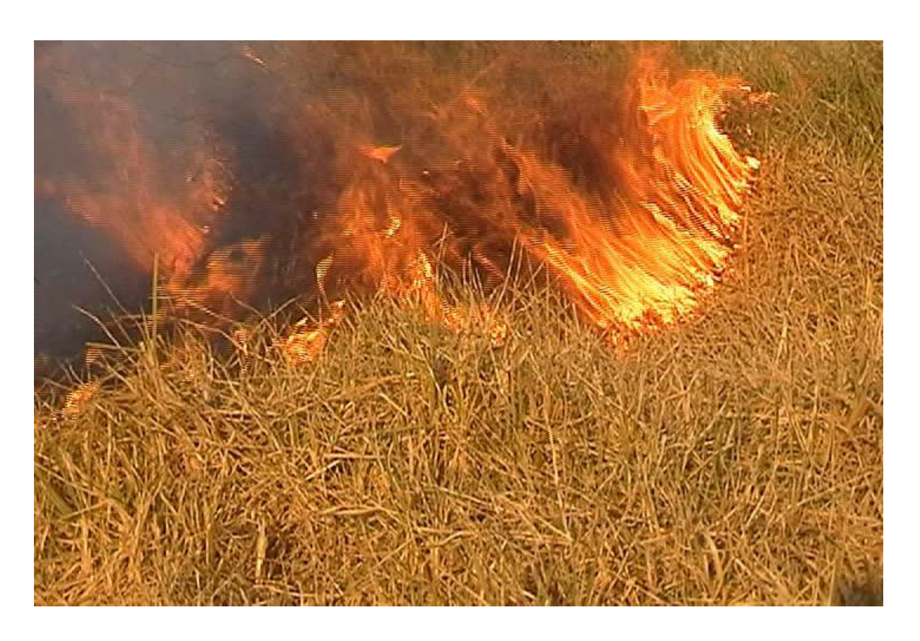
Photograph 4 A potential grassland fire.