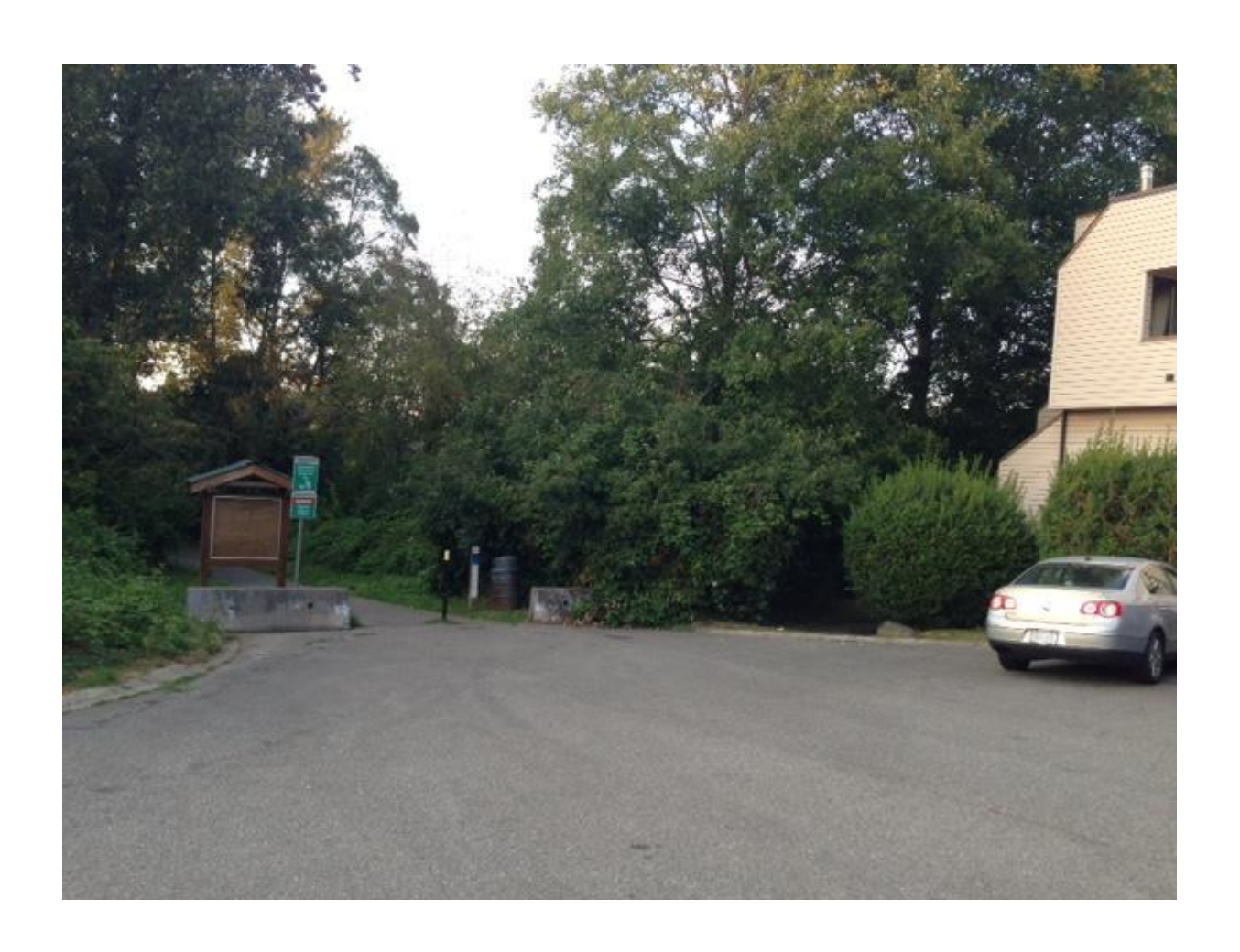
Photograph 3 Trail to Nicomekl River Floodplain, note residences in fire catchment area.