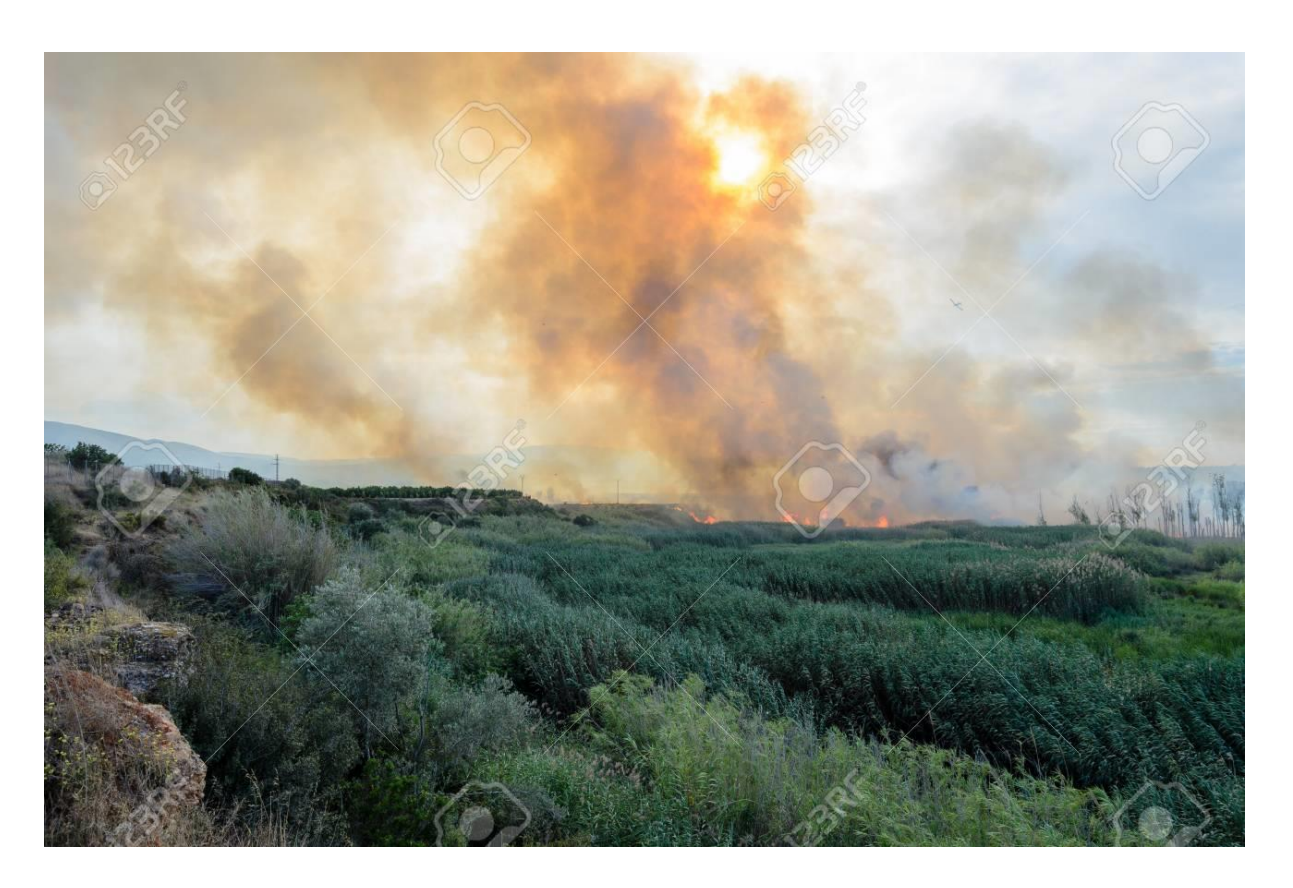
Photograph 5 Potential smoke and fire in a grassland.