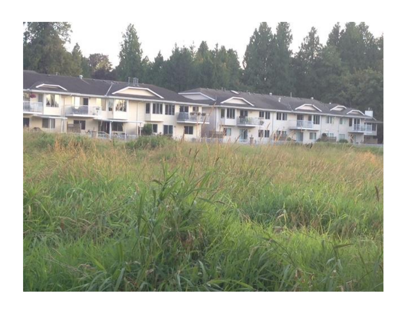
Photograph 1 Grassland, Nicomekl River Floodplain