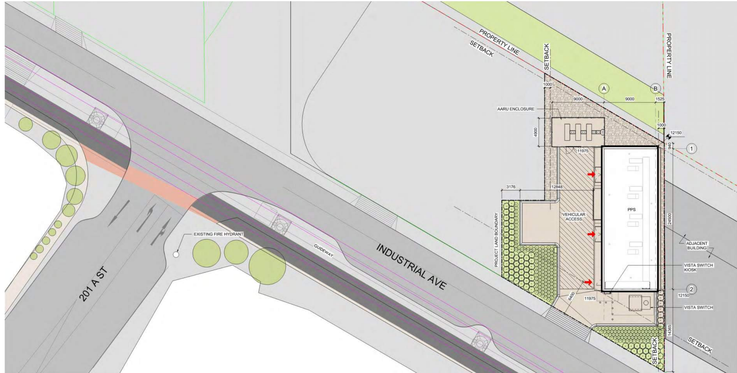
1 SITE PLAN 1051 1:200