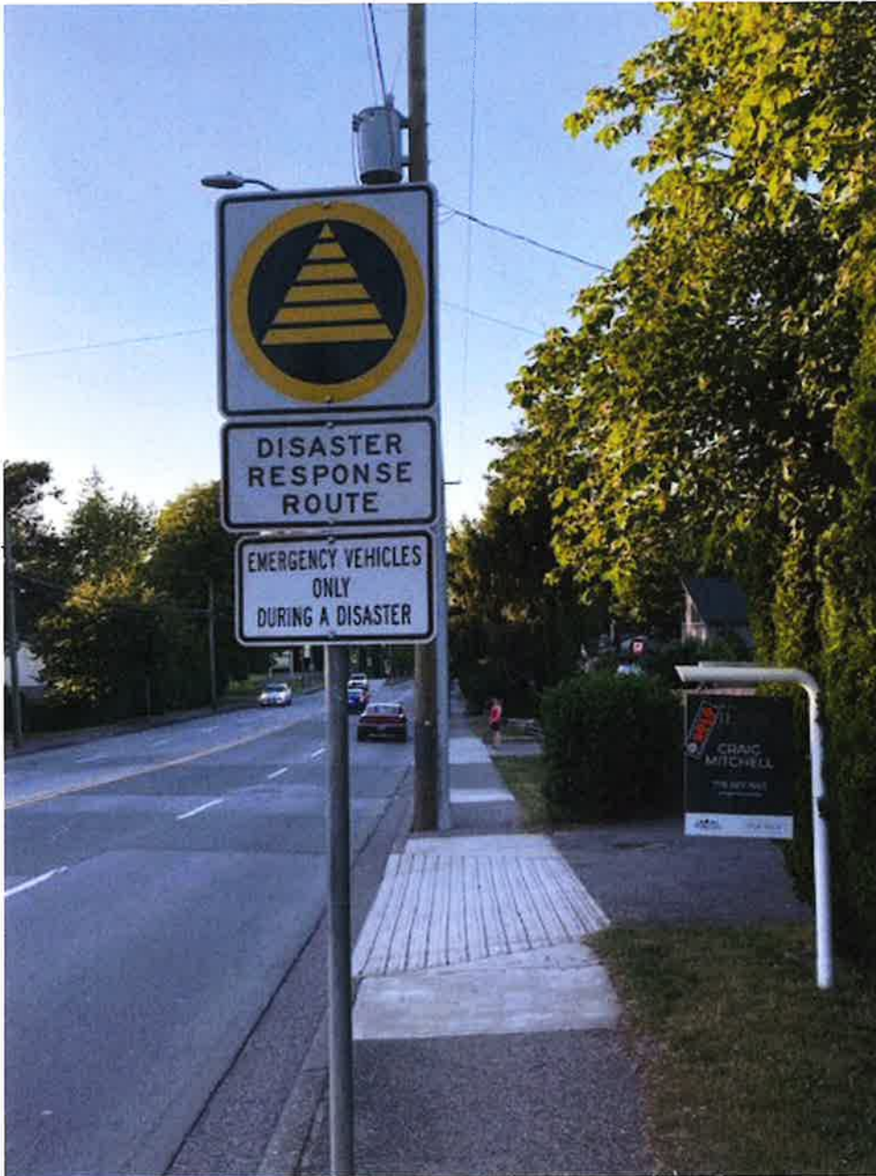
Photograph 7 Sign on 200 Street approximately 230 metres south of Grade Crescent intersection.