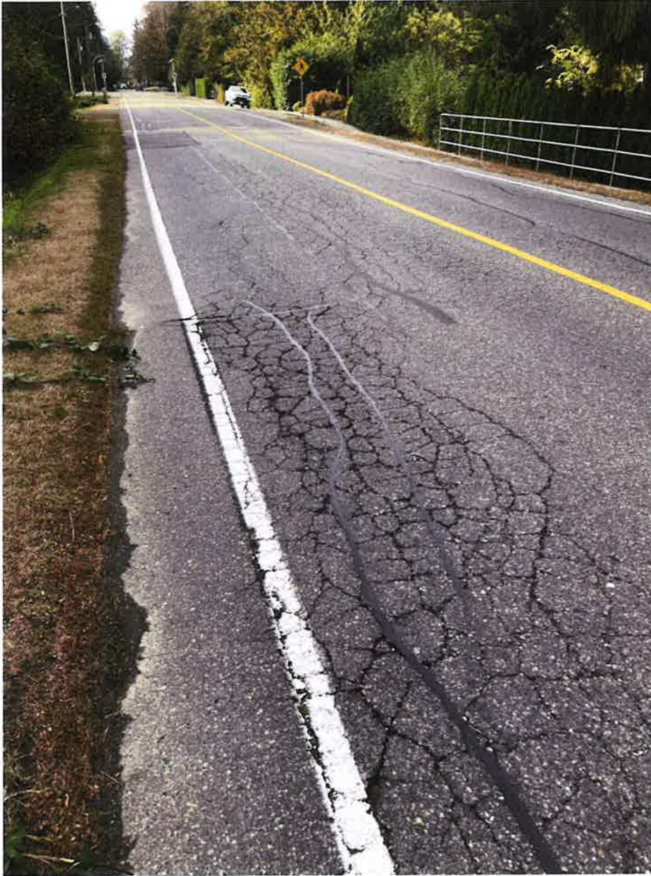
Photograph 10 Muckle Creek culvert (note cracks in south side of road overlying culvert)