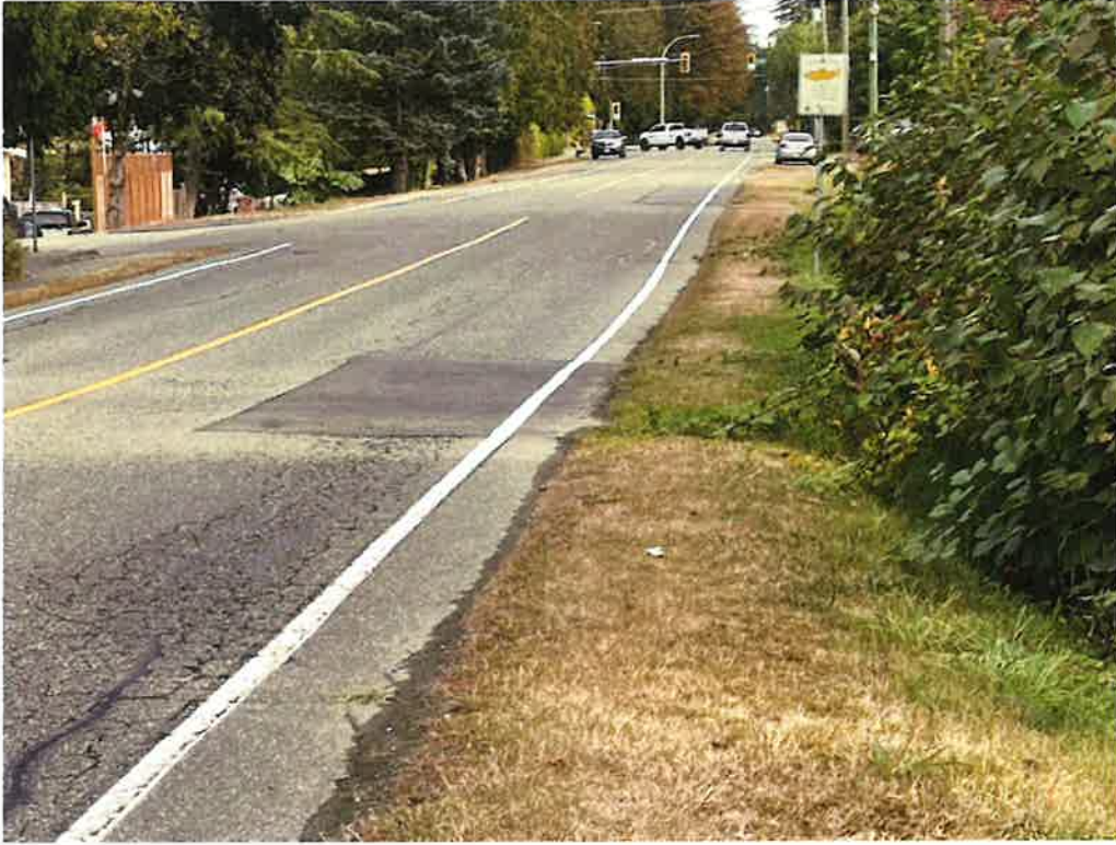
Photograph 8 Muckle Creek culvert (note dip in road)