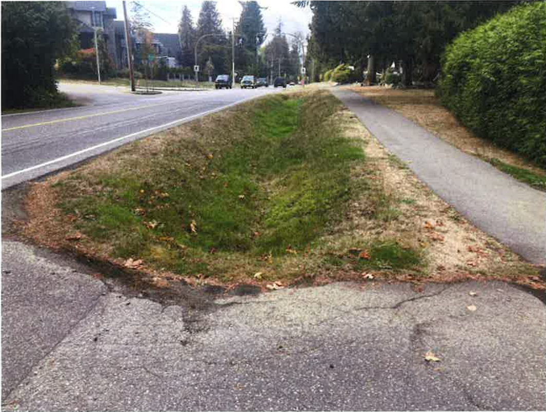
Photograph 2 Ditch 20123 Grade Crescent