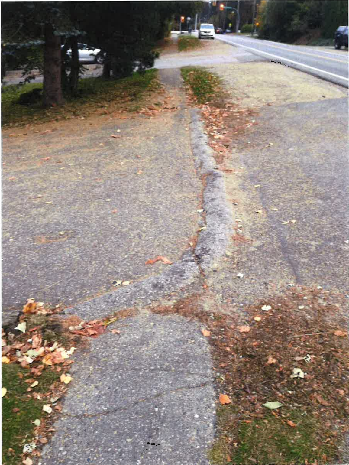
Photograph 1 Inclined pathway (20279 – 20281 Grade Crescent, -6 degree slope, not pedestrian friendly)