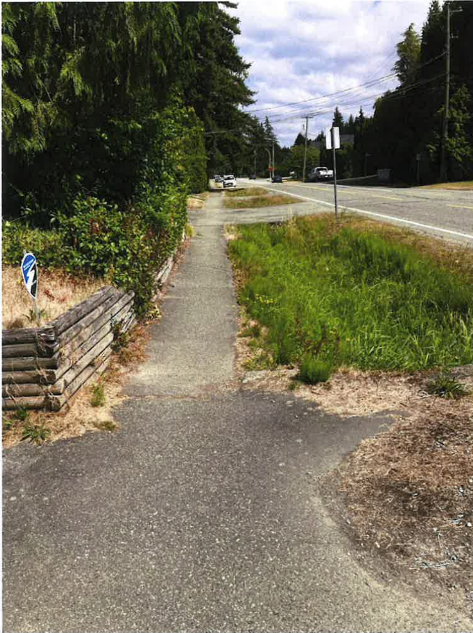
Photograph 1a Note narrow uneven and broken pathway and close proximity to ditch.