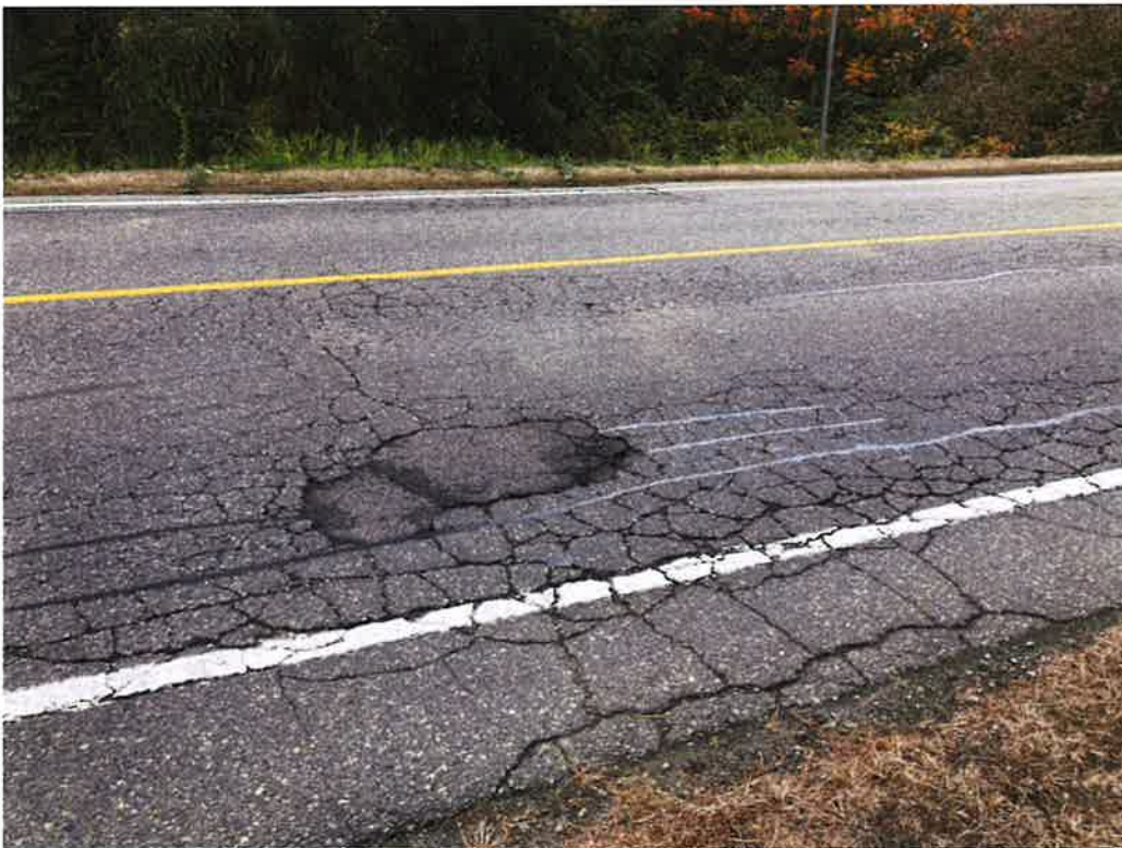
Photograph 9 Muckle Creek culvert (note patched sink hole and cracks in north side of road overlying culvert)