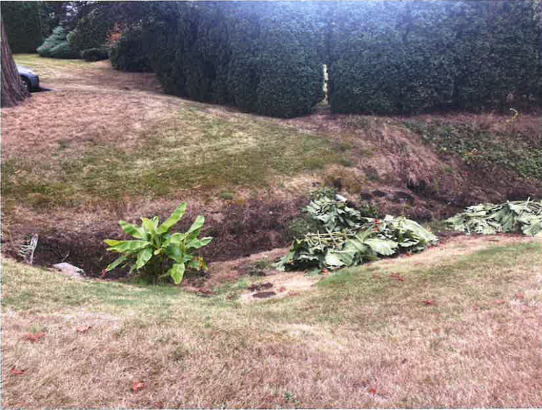
Photograph 4 Ditch 20170 Grade Crescent (20 degree inclined side)