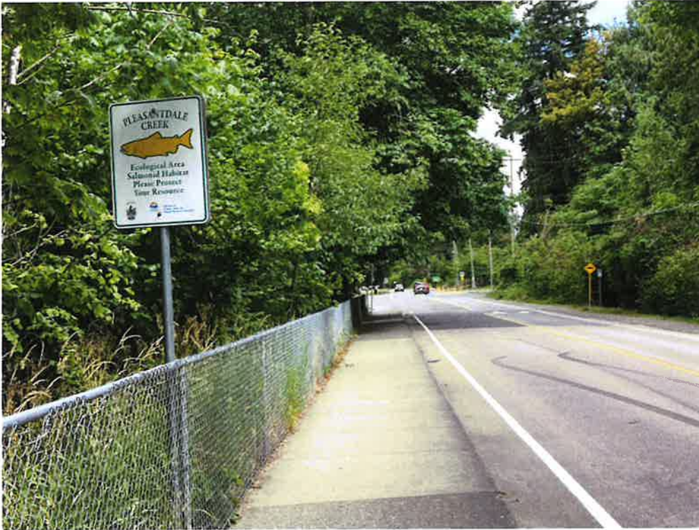
Photograph 11 Signage regarding salmon bearing Pleasantdale Creek