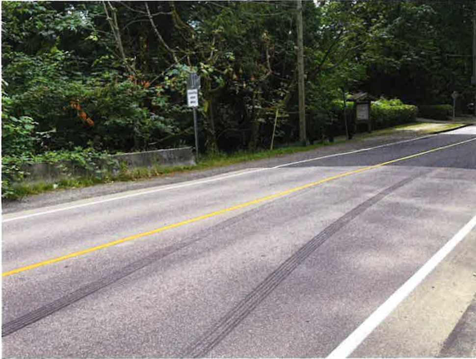
Photograph 14 Walkway entrance to Pleasantdale Creek trail on Grade Crescent needs to be improved to avoid potential pedestrian accident.