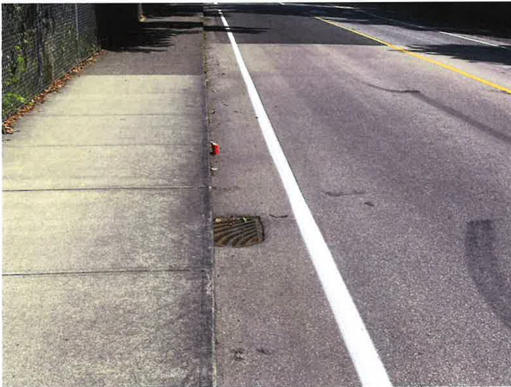
Photograph 12 Note drainage cover on Grade Crescent that drains into salmon bearing Pleasantdale Creek