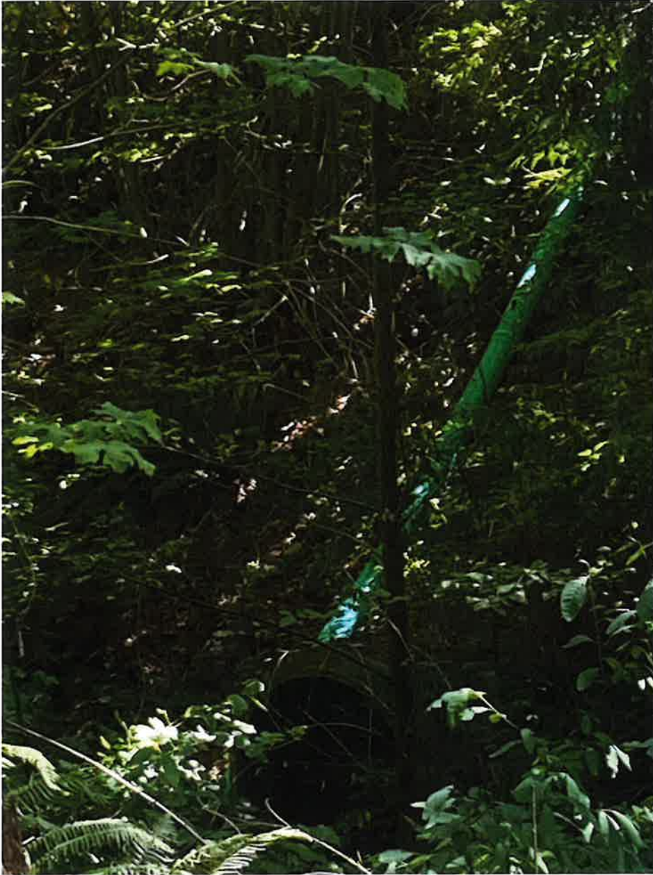
Photograph 13 Note green drainage pipe from drainage cover on Grade Crescent diverting runoff road water into salmon bearing Pleasantdale Creek .