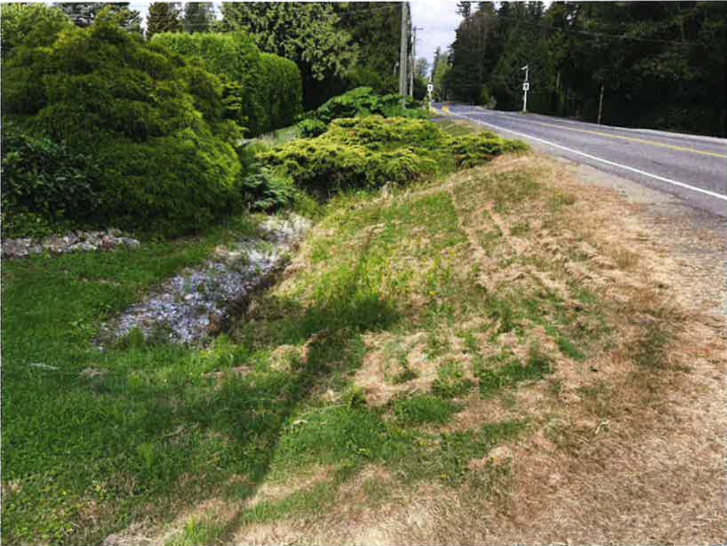
Photograph 5 Ditch 20200 Grade Crescent (20 degree inclined side)