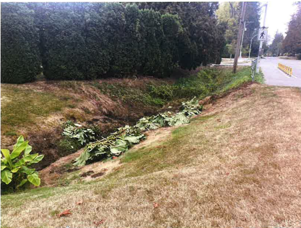
Photograph 3 Ditch 20170 Grade Crescent (20 degree inclined side)