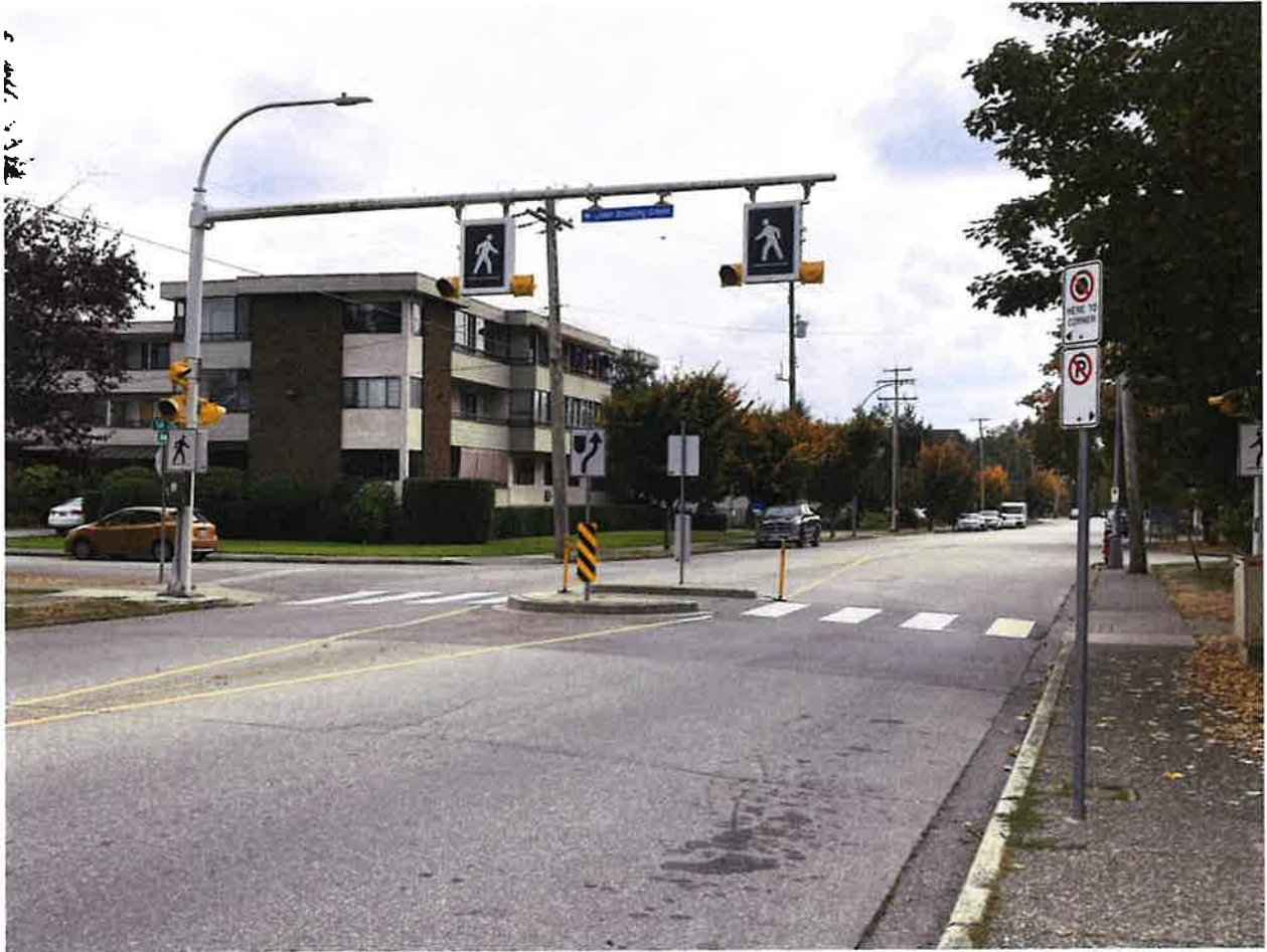
Photograph 6 Controlled pedestrian crosswalk on 204 Street