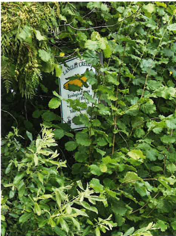
Photograph 15 Signage is partially overgrown and not readily visible.