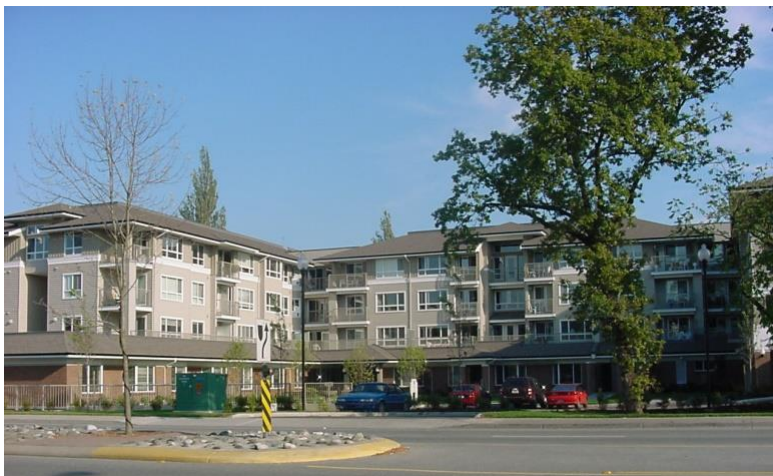
Harrison Landing – Congregate Housing