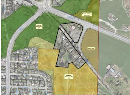
Old Yale Road Seniors District Context Map

Residential density - 173 units/hectare Floor space ratio - 1.50 Building height – 6 storeys